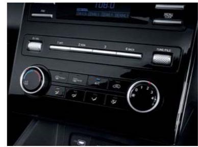
Manual air conditioning system