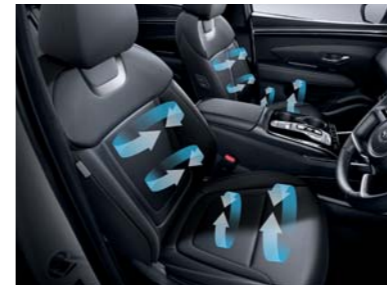
Ventilated front seats