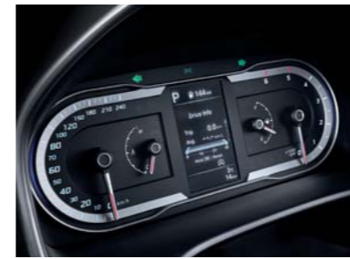
4.2" TFT LCD Supervision cluster