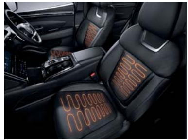
Heated front seats