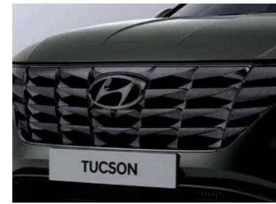
Dark black chrome radiator grille