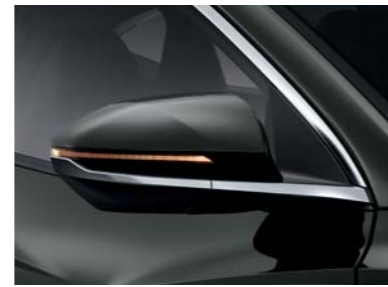
Outside mirror LED repeaters (Optional)