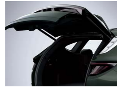
Smart tailgate system