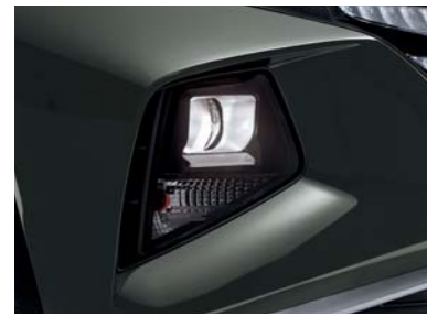
Projection headlamps (Standard)