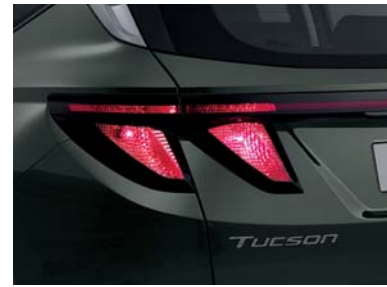
Rear combination lamps (Standard)