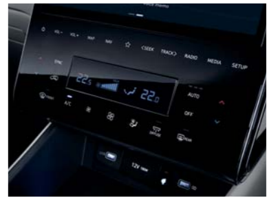
Full auto air conditioning system