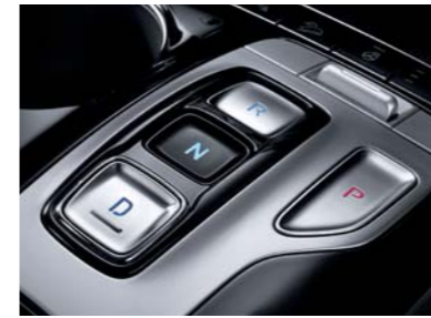
Shift-by-wire automatic transmission (Optional)