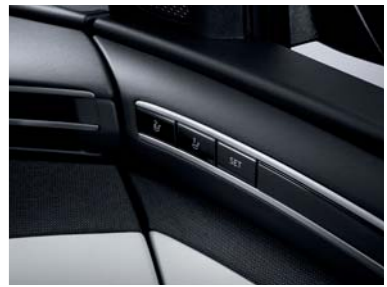
Integrated memory system (IMS)