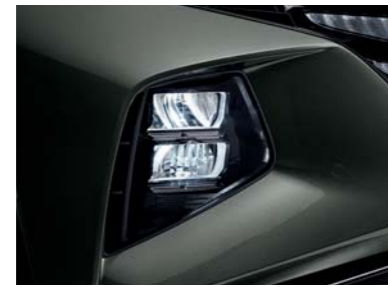
MFR LED headlamps (Optional)