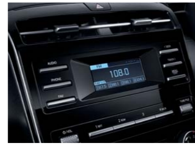
3.8" Standard audio system