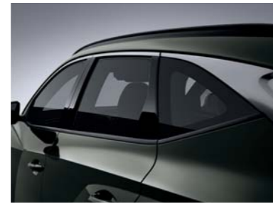
Chrome-coated DLO molding