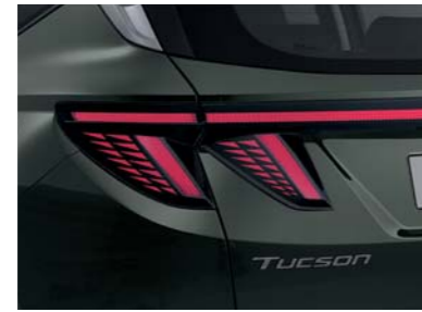
LED rear combination lamps (Optional)