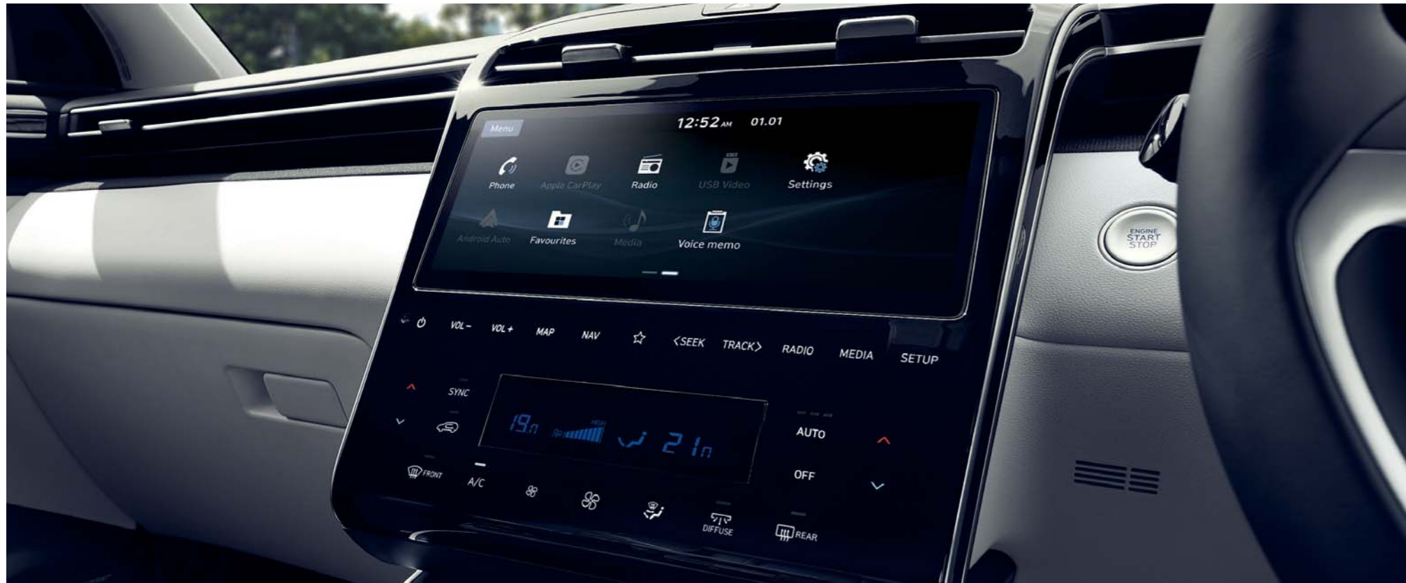
10.25" LCD touchscreen