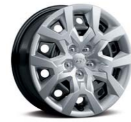
17" Steel Wheels