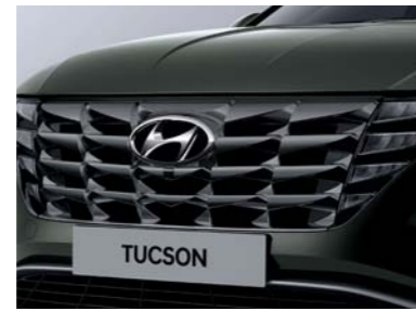
Silver paint radiator grille