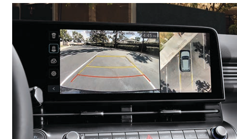
Surround View Monitor