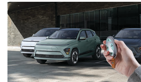
Remote Smart Parking Assist