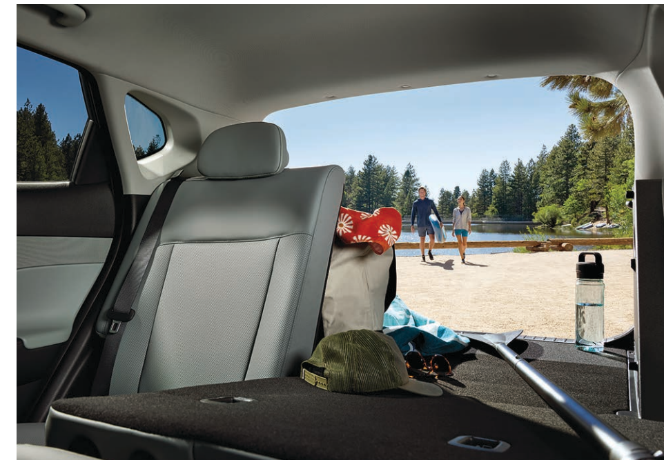
60/40 split fold-flat 2nd-row seatbacks