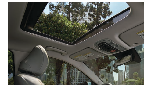
Power tilt-and-slide sunroof