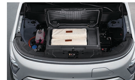
Front under-hood storage tray