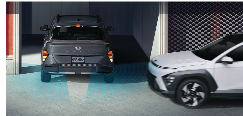
Rear Cross-Traffic Collision-Avoidance Assist

Parking? Kona Electric Limited's Surround View Monitor helps alleviate the stress of chaotic parking lots. 11 Its Parking Distance Warning-Reverse/Forward/Side feature with a new Contour Warning provides visual and audio alerts based on the proximity of surrounding objects. Parking Collision-Avoidance Assist-Reverse automatically assists with emergency braking if the risk of a collision increases after the initial warning. 12 Using buttons on your key fob, you can also pull your vehicle into and out of tight parking spaces using Remote Smart Parking Assist from outside of your vehicle. 13