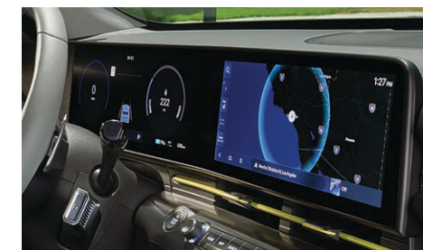
Dual 12.3" integrated displays