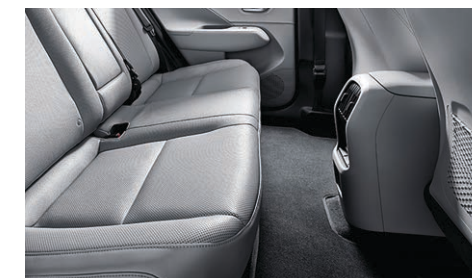
2nd-row flat floor